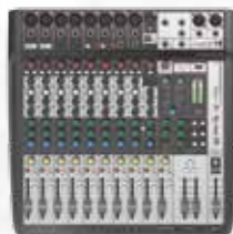
Signature 12 MULTI-TRACK

Also available: Signature Series Multi-track versions with multi-channel ultra-low latency USB audio interface -