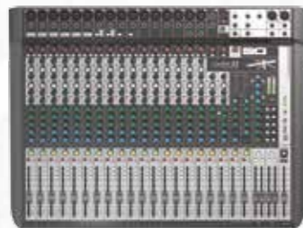
Signature 22 MULTI-TRACK

Soundcraft, Harman International Industries Ltd., Cranborne House, Cranborne Road, Potters Bar, Hertfordshire EN6 3JN, UK T: +44 (0)1707 665000 F: +44 (0)1707 660742 E: soundcraft@harman.com Soundcraft USA, 8500 Balboa Boulevard, Northridge, CA 91329, USA T: +1-818-893-8411 F: +1-818-920-3208 E: soundcraft-usa@harman.com