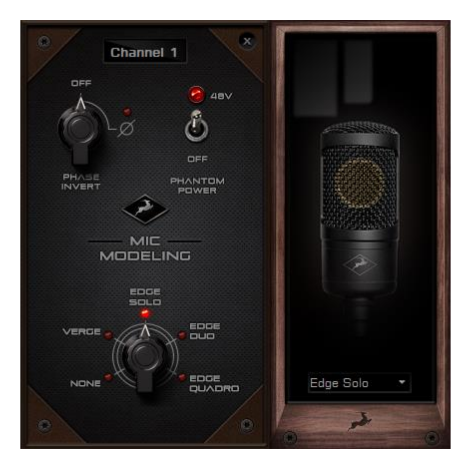
Edge Solo Mic Emulations Window

The following functionality is available: